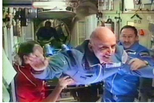
Figure 4: Dennis Tito arriving at ISS

Governments are supporting the tourism infrastructure in several ways. Governments have laid the foundation for space tourism with previous transportation and lodging initiatives such as the ISS. However, most people involved managing these projects view these efforts as scientific initiatives that should not be used to promote tourism. Russia has bucked this trend by selling seats on Soyuz rockets and persuading other countries to allow Dennis Tito and Mark Shuttleworth to stay on the ISS as shown in Figure 4. However, these actions were based more on Russia's financial needs rather than a genuine interest in directly supporting tourism.