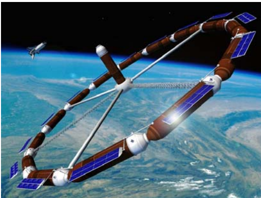
Figure 2: Rotating Hotel (Space Island Group)

This will result in a mass space tourism market employing space hotels as shown in Figure 2.