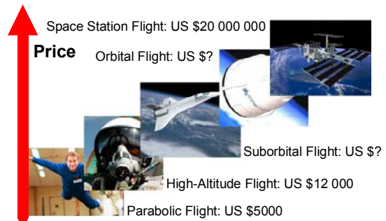
Figure 1: Space Tourism Market (Goehlich)

Space tourism flights, the next evolutionary step in the travel and tourism industry's "adventure tourism" market, may soon get off the ground with the availability of the next generation of space vehicles optimized to take advantage of a high volume of ticket purchasing passengers that can drastically reduce space launch costs. Today, several private companies are planning vehicles that will put fare-paying customers into space in the next years. Numerous organizations are doing their part to promote space tourism. From the economic point of view, greatly increased travel leads to economies of scale and other efficiencies (such as industry standards) that drive down cost. In the presence of competition, declining costs are quickly followed by declining prices and increased demand. This in turn leads to a virtuous circle of economic growth.